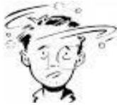
Feeling Dizzy or Lightheaded