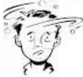
Feeling Dizzy or Lightheaded