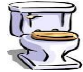
Constipation or Diarrhea