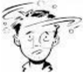
Feeling Dizzy or Lightheaded